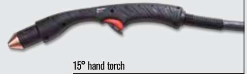
15° hand torch