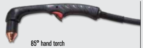
85° hand torch

(for more torch options, see www.hypertherm.com )