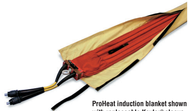
ProHeat induction blanket shown with replaceable Kevlar® sleeve.

The blankets easily conform to circular and flat parts and install in a matter of seconds. Manufactured from durable high-temperature materials, flexible induction blankets are designed to withstand the tough conditions in both industrial and construction applications.